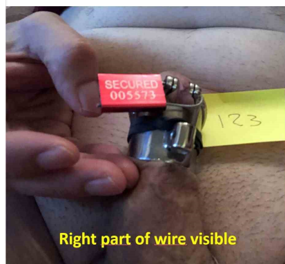
Right part of wire visible