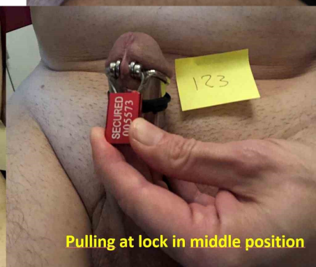
Pulling at lock in middle position

Per session maximum doesn't do anything at the moment (future tasks may make use of it, so you should still set a reasonable value).