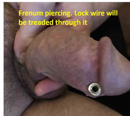
Frenum piercing. Lock wire will be treaded through it

Please fail the validation task if this is not clearly shown.